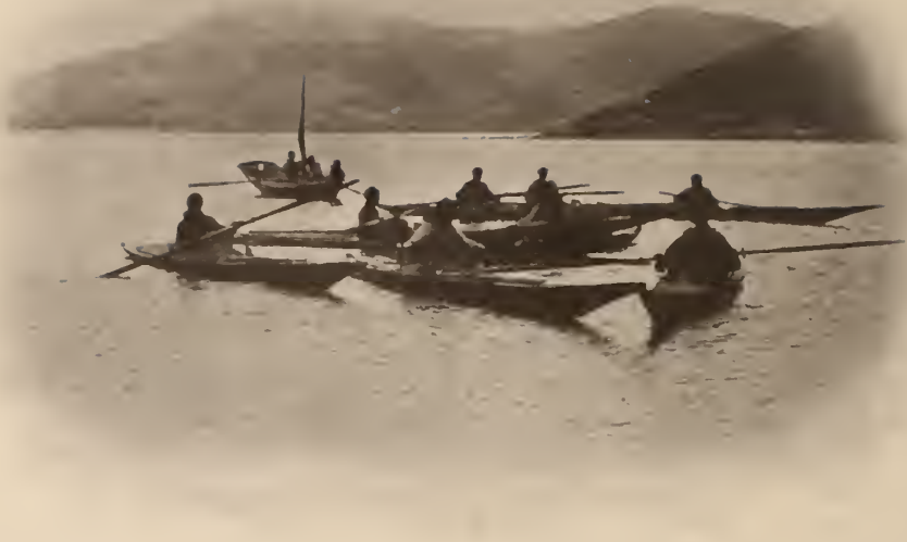
THE LABRADOR ESKIMOS IN THEIR KAYAKS